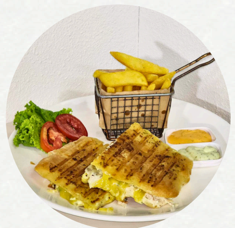
Grilled Tuna Melt Panini