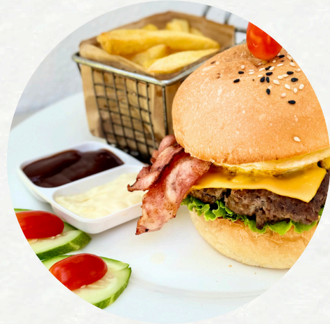
Lym's Smashed Burger

*** All comes with a side of greens, french fries and Homemade Sriracha mayo & Aioli dips***