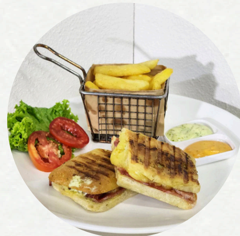
Grilled Ham & Cheese Panini