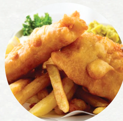
Beer Batter Fish & Chips