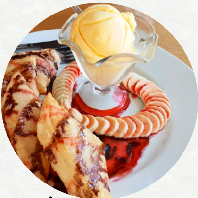
Roti Ice cream